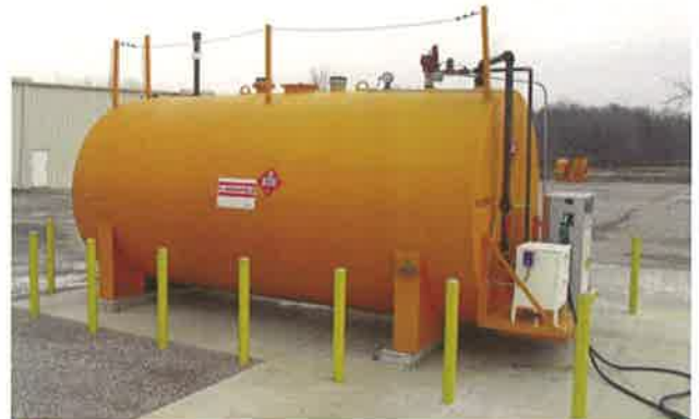
Compatible with a wide range of fuels and chemicals, including biodiesel and ethanol