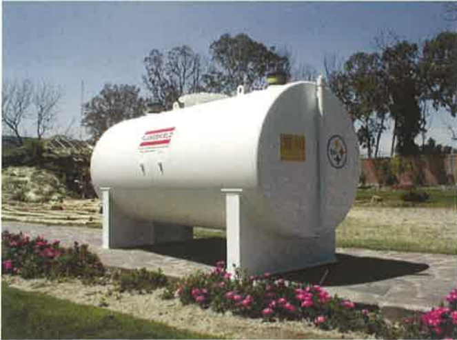
2-Hour 2000° fire-tested performance

FLAMESHIELD® aboveground storage tanks are manufactured with a tight-wrap double-wall design. Standard features include 2-hour fire-tested performance, built-in secondary containment and interstitial monitoring capability.